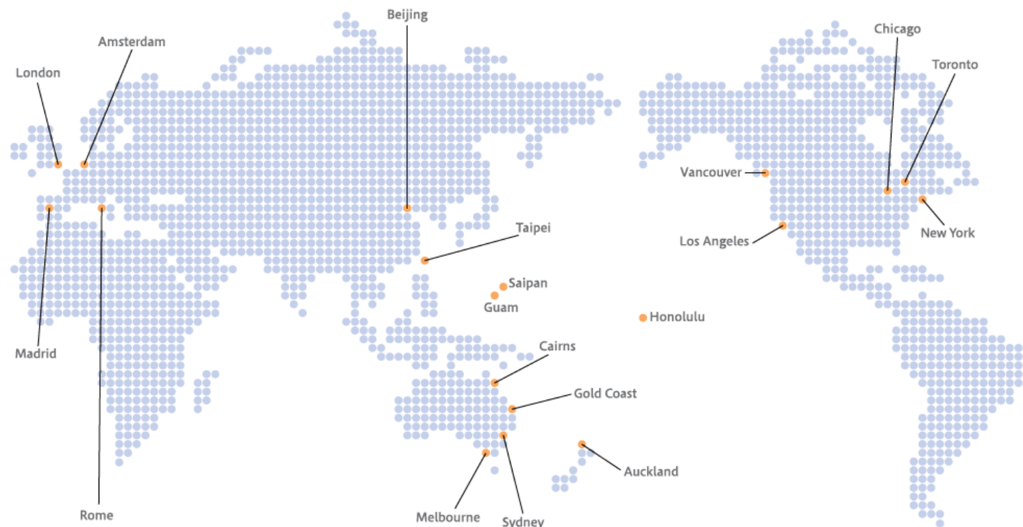
Kintetsu Network around the world