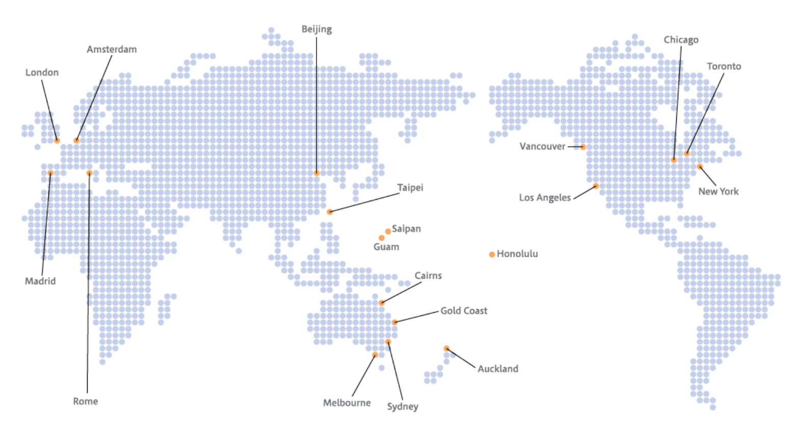
Kintetsu Network around the world